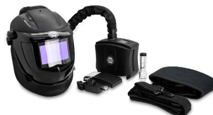
DW7000XL comes with battery powered air respirator.